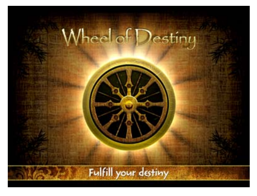
Hero's Journey through Dreamscape for Iphone and Ipad